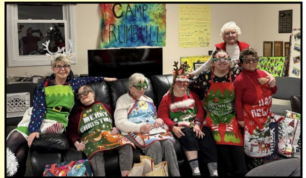
Our Golden Gang enjoyed their own holiday party!

We had an amazing holiday party at the Wheeler YMCA which enabled us to include not only our members but families and staff for the first time in years! Thank you to everyone who made it possible!